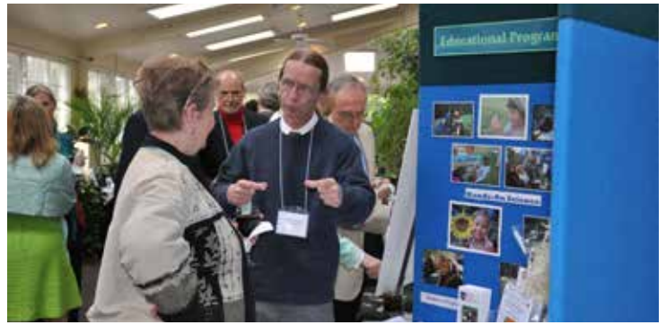
We had 130 attendees at our Annual Dinner.