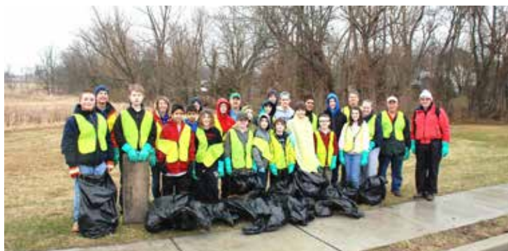
Over 600 volunteers helped clean up road ways and streams during the annual Red Clay Valley Clean up.