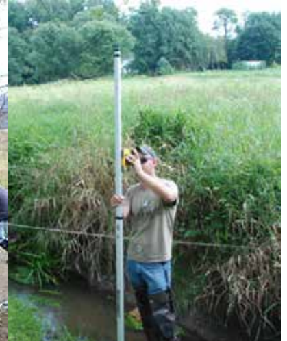
Measurements are made of the Upper East Branch to develop a restoration design.