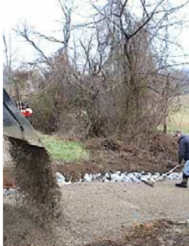
Livestock crossing being installed on a tributary to the East Branch of Red Clay.