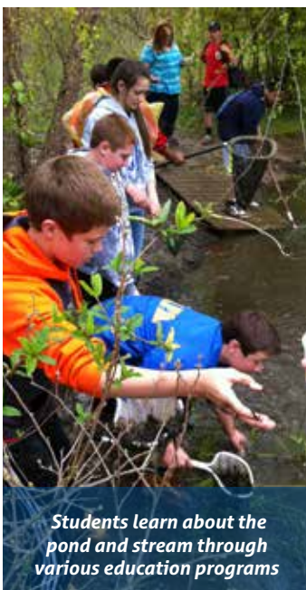
Students learn about the pond and stream through various education programs