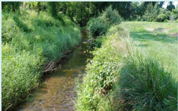
This 400 ft. section of Plum Run will be restored this fall with streambank grading, in-stream structures, and a buffer of native plants and trees.

The second project, in the Red Clay Watershed, will protect and improve about 1,500 feet of the upper east branch just below its source. This site is a horse farm and the work will include streambank stabilization, fencing, stream crossings, a tree and shrub buffer, and improvements to agricultural practices. BRC is partnering with several organizations on this project, which is funded by a grant from the National Fish and Wildlife Foundation and support from Stroud Water Research Center, the U.S. Department of Agriculture, and SUEZ Water.