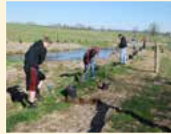
Over 50 volunteers plant trees in Honey Brook along the Brandywine's upper west branch.

In the last 12 months, 6 Red Streams Blue projects have been completed, the most active year yet! 5 stream buffer plantings were also completed in the past year totaling nearly 2,000 trees and shrubs. The most recent project on Ludwig's Run near Downingtown included a streambank restoration as well as the repair and restoration of a stormwater basin at the top of the stream.