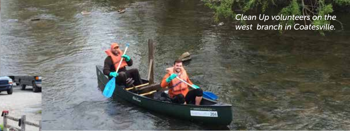
Clean Up volunteers on the west branch in Coatesville.