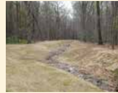
Completed section of Ludwig's Run.