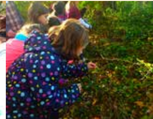
Searching for different animal habitats within the fall leaves.