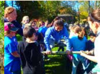
"I get by with a little help from my friends..." Teambuilding elements encourage students to work together, build trust and solve challenging problems.