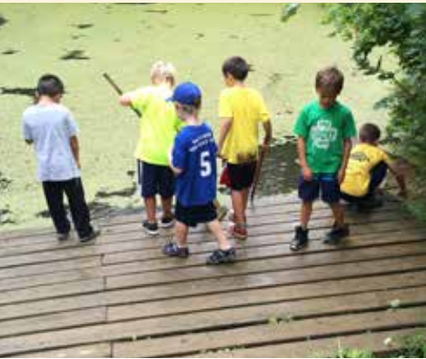
2015 Campers enjoying some time at the pond.