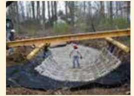
Concrete cable mats installation on Ludwig's Run's stormwater basin.