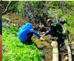
Water bug sampling in the stream. The chilly weather didn't stop these determined scientists!

Whether exploring the pond, learning about the importance of wetlands or working together to overcome challenges as a team – school students are guaranteed a day of hands-on, engaging programs.