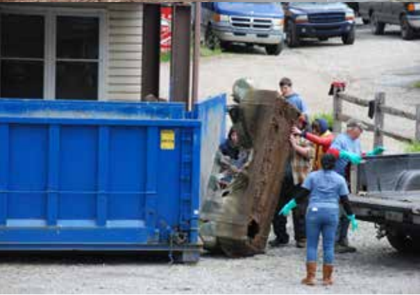
All in all, 2 tons of trash was removed from the Brandywine!