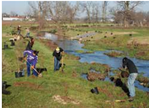
Some of the 30 volunteers planting a tree and shrub buffer along a restored section of the Upper West Branch Brandywine.

The focus of activity this fall has been the Upper West Branch Brandywine in Honey Brook Township near the headwaters of the Brandywine. In the fall of 2015, the first of three stream restoration and livestock fencing projects was completed.